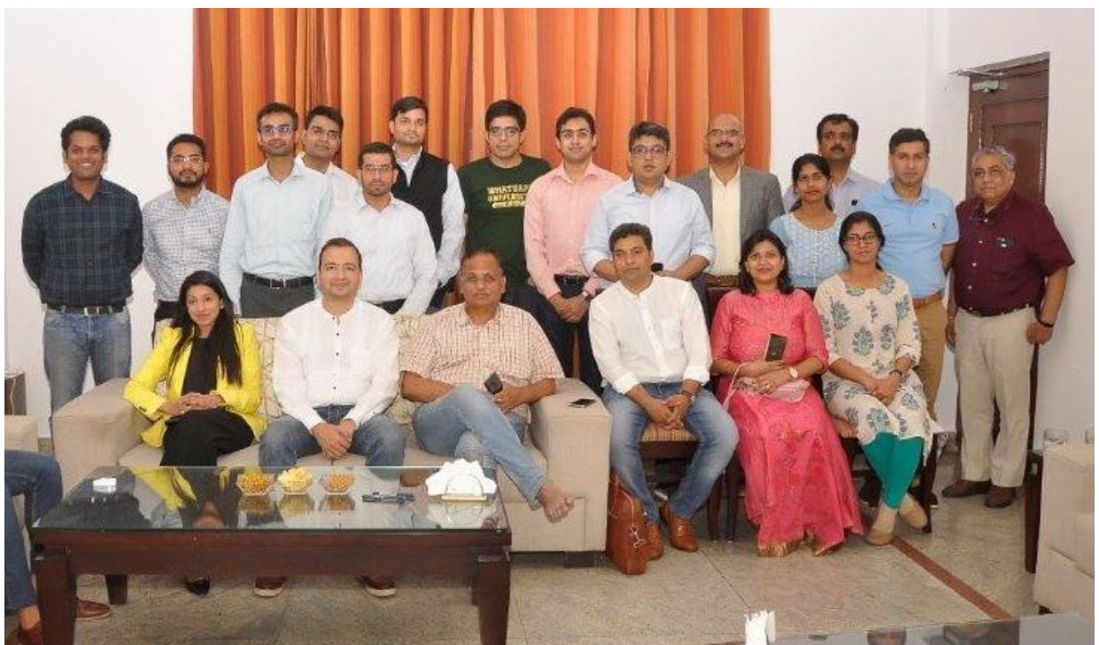
YLC Delhi NCR Chapter Members with Mr Satyendra Jain