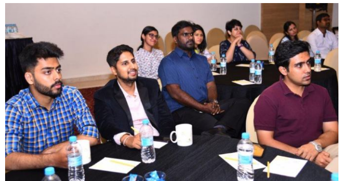
YLC Bengaluru Chapter Members